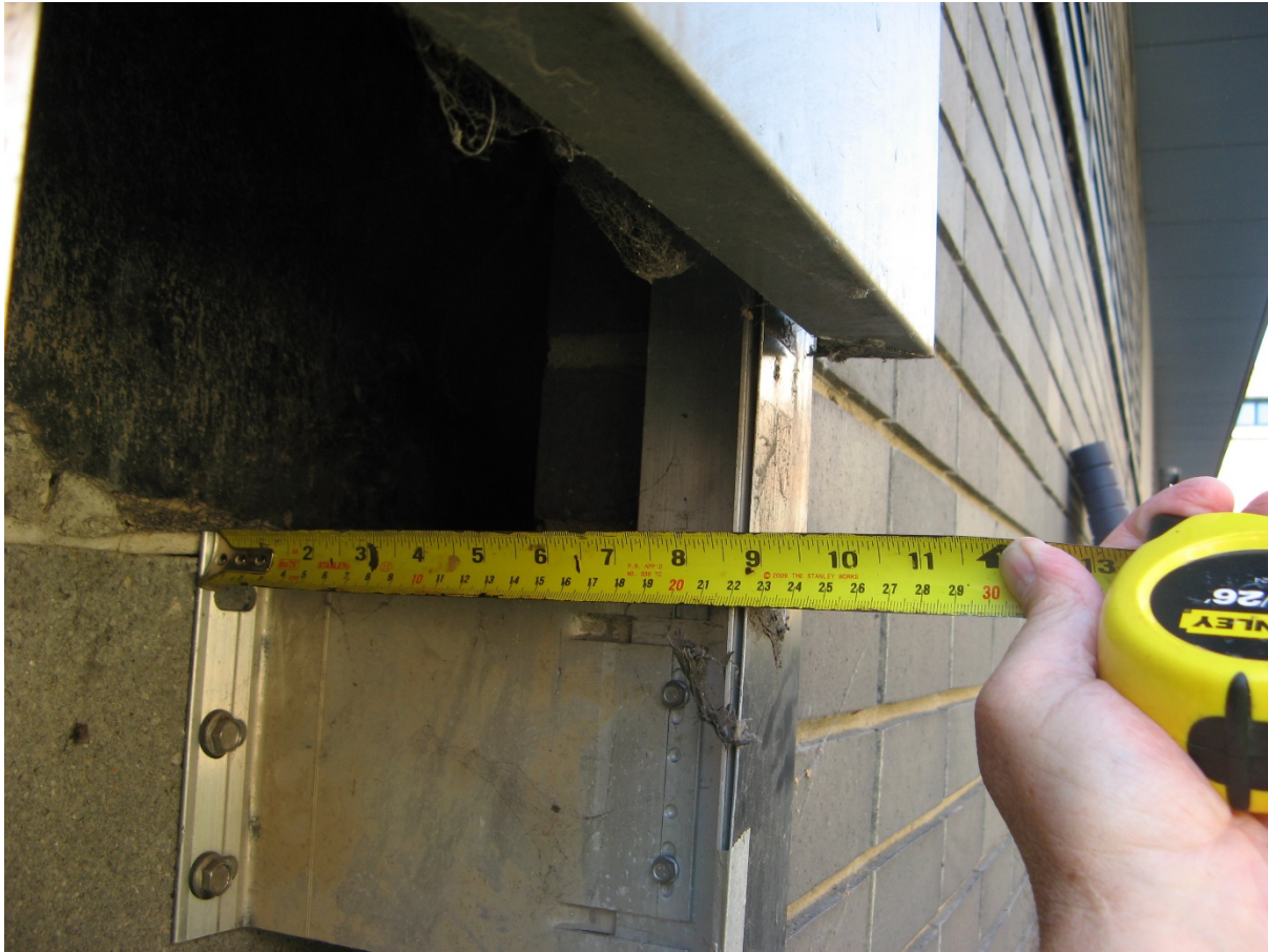
Figure 13 – Inspection Area 1 - existing composite metal rainscreen cladding (ACM) aperture at junction between SG curtain walling and tiled masonry, exposing blockwork substrate behind. Note there is no evidence of insulation and or fire-stopping within the cladding zone.