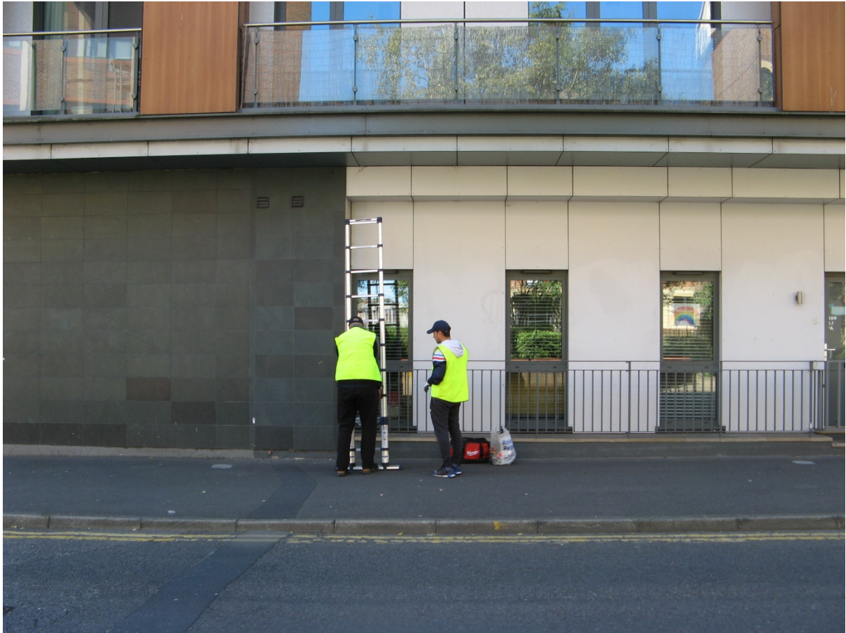
Figure 18 – Inspection Area 3