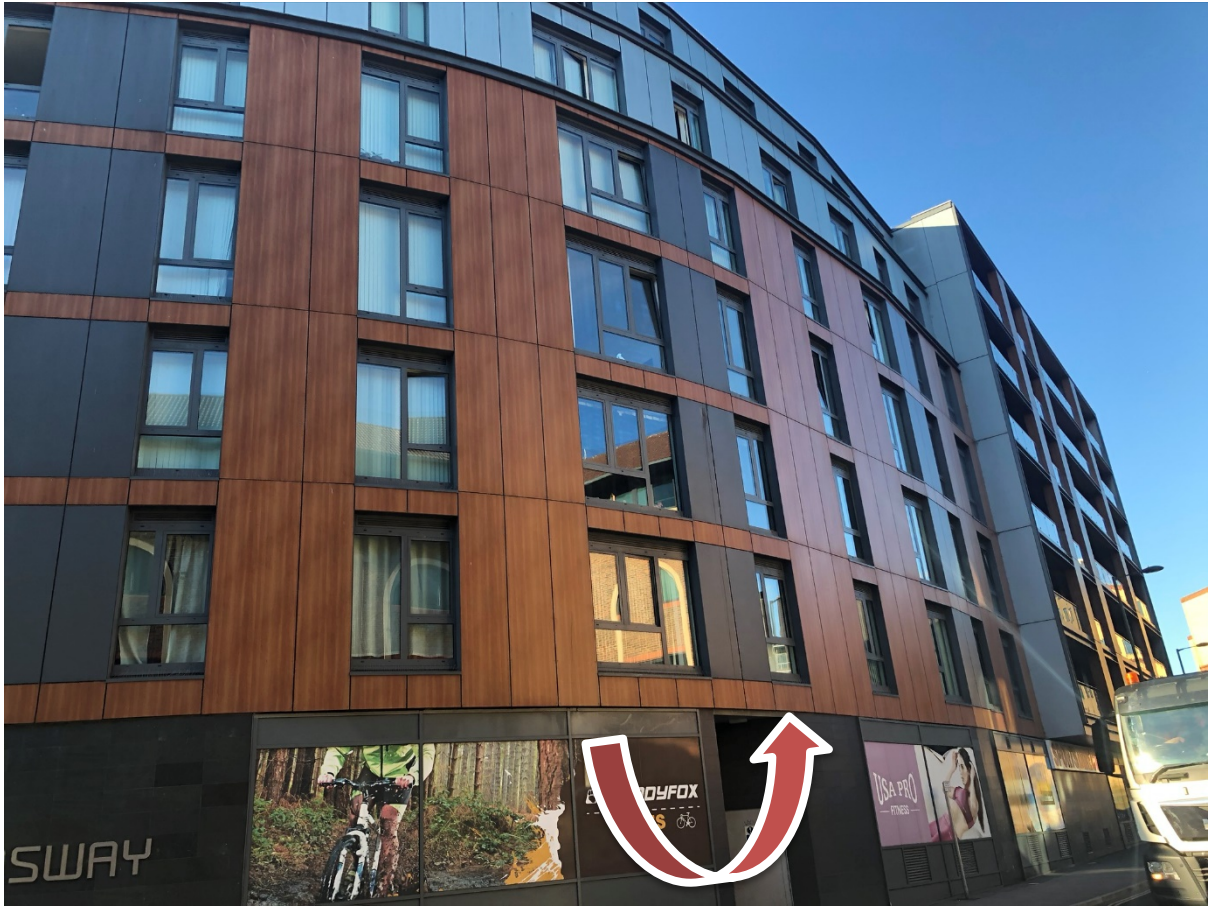
Figure 2 – Main elevation – Inspection Location Area 2