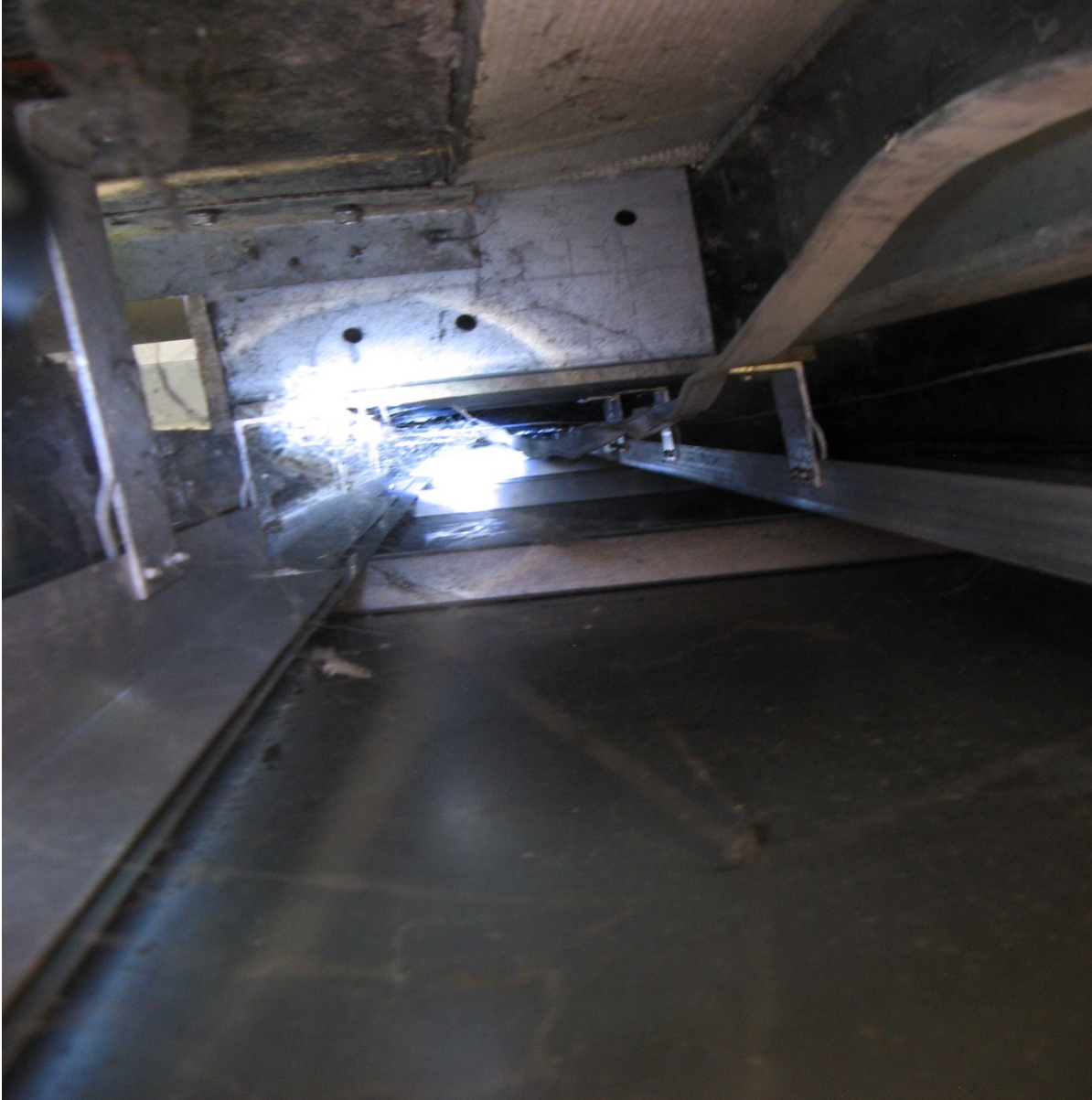
Figure 12 – Inspection Area 1 - existing composite metal rainscreen cladding (ACM) at junction between SG curtain walling and tiled masonry, exposing blockwork substrate behind. Note there is no evidence of insulation and or fire-stopping within the cladding zone.