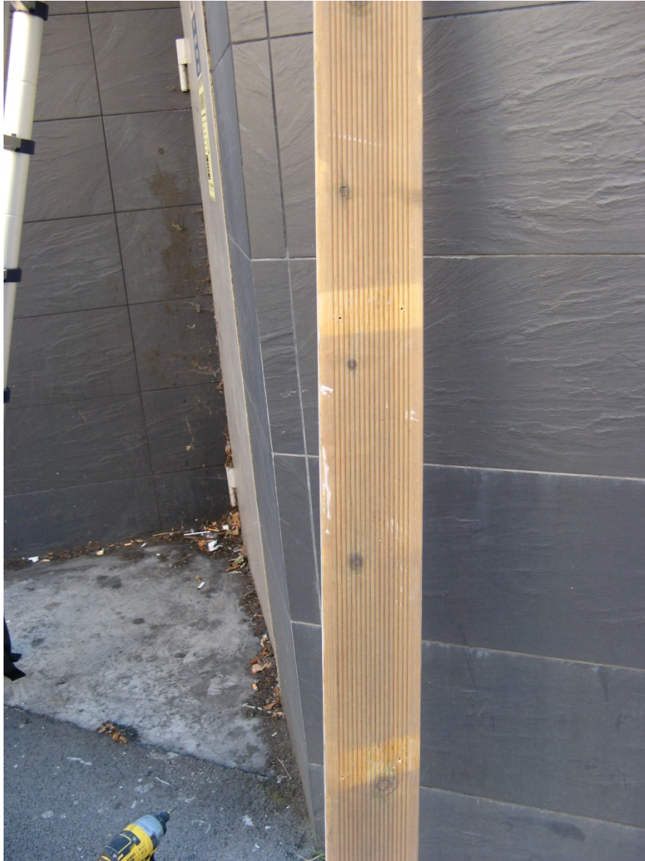
Figure 16 – Inspection Area 2 - removal of existing fluted timber decking board to soffit.