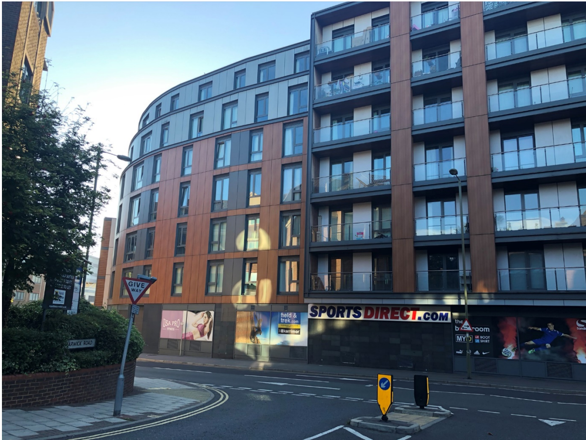
Figure 1 – Main elevation