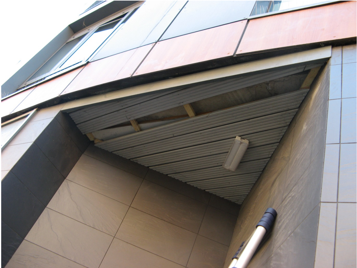
Figure 15 – Inspection Area 2 – removal of existing fluted timber decking board to soffit.