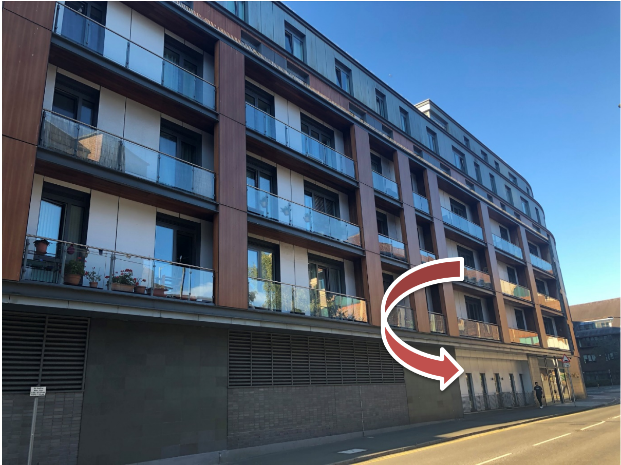
Figure 7 – Main elevation – Inspection Location Area 3