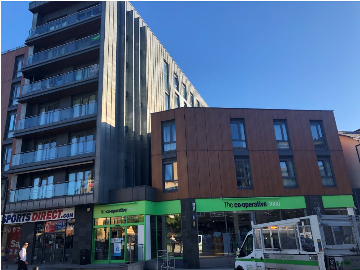
Figure 6 – Main elevation