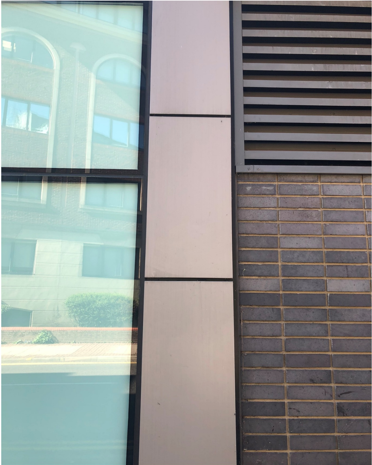
Figure 8 – Inspection Area 1 – existing composite metal rainscreen cladding (ACM) at junction between SG curtain walling and tiled masonry.