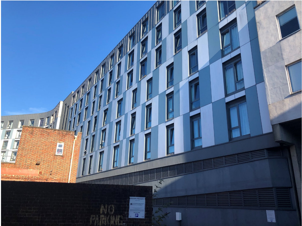
Figure 4 – Rear elevation