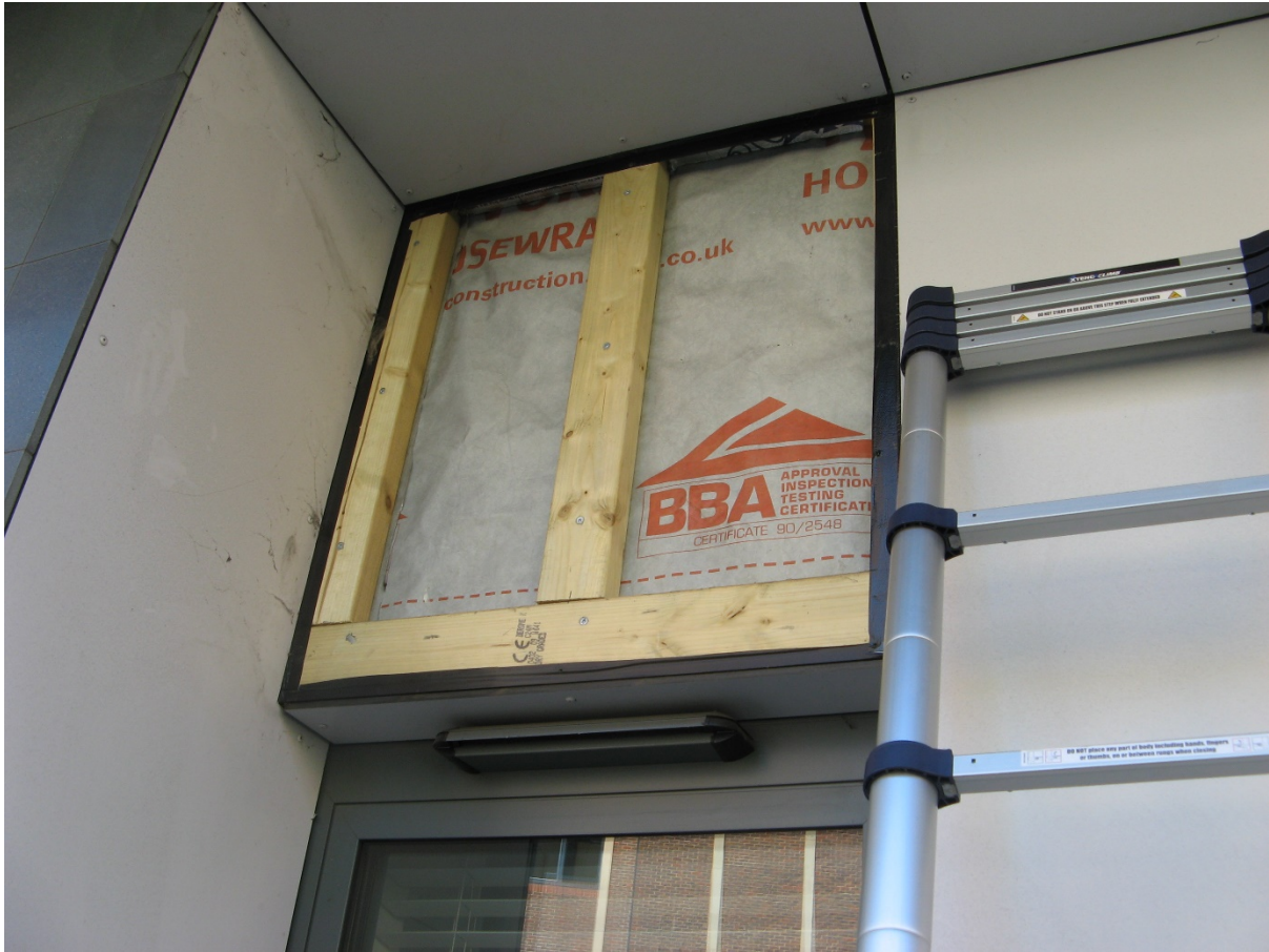
Figure 19 – Inspection Area 3 – removal of existing high pressure laminated board cladding