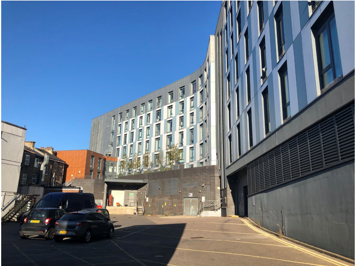
Figure 5 - Rear elevation