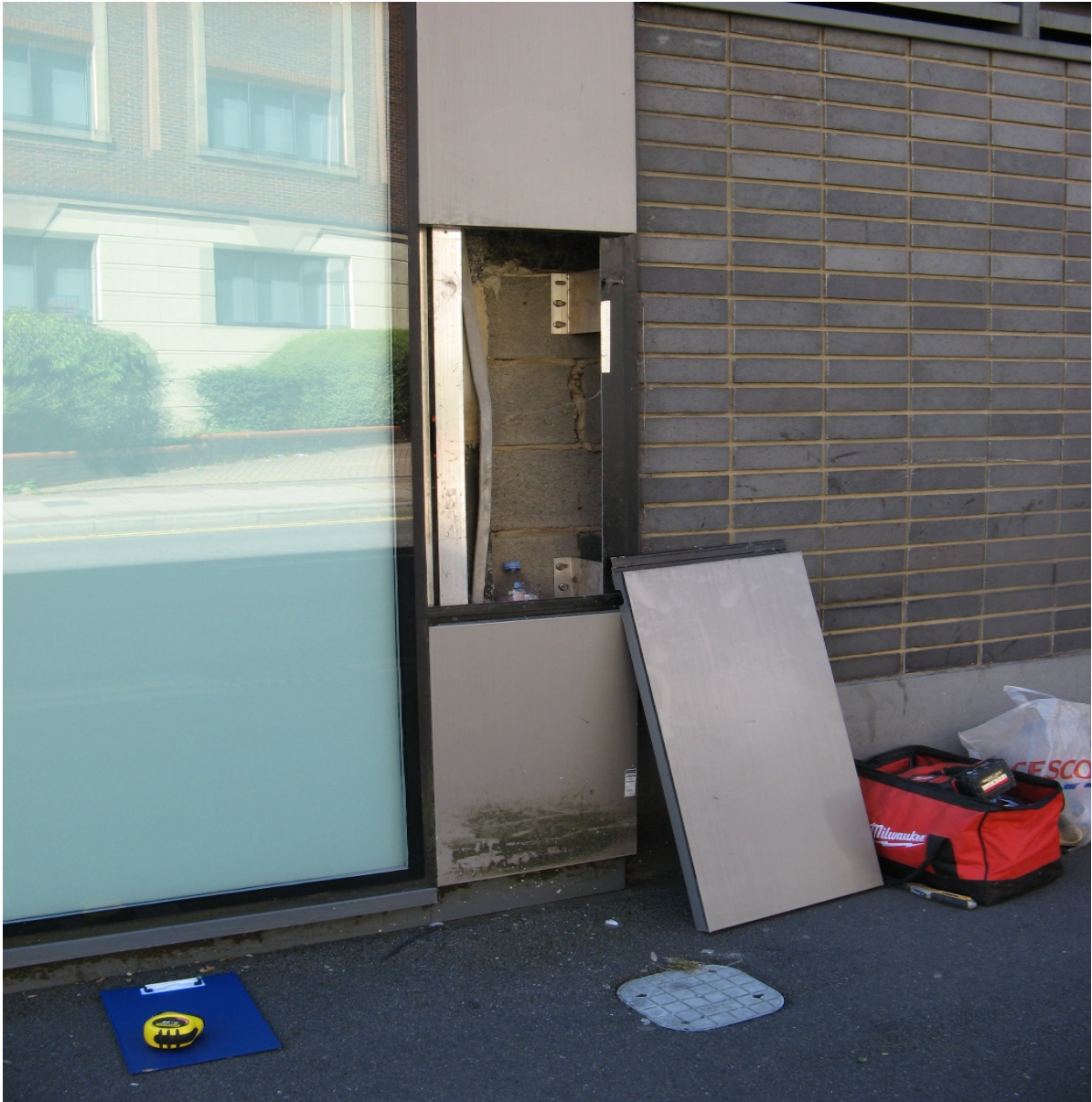
Figure 9 – Inspection Area 1 - existing composite metal rainscreen cladding (ACM) at junction between SG curtain walling and tiled masonry, exposing blockwork substrate behind.