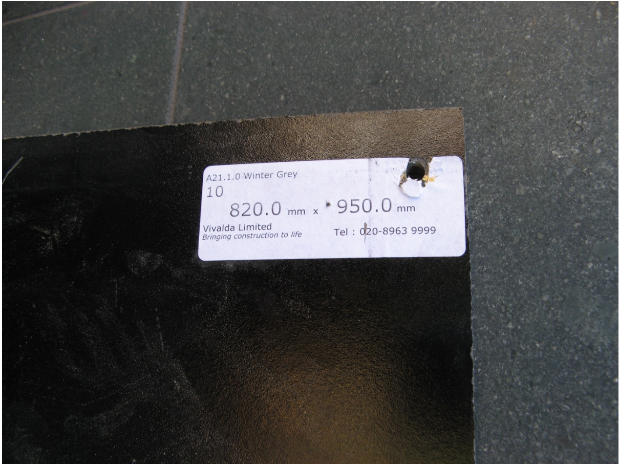
Figure 21 – Inspection Area 3