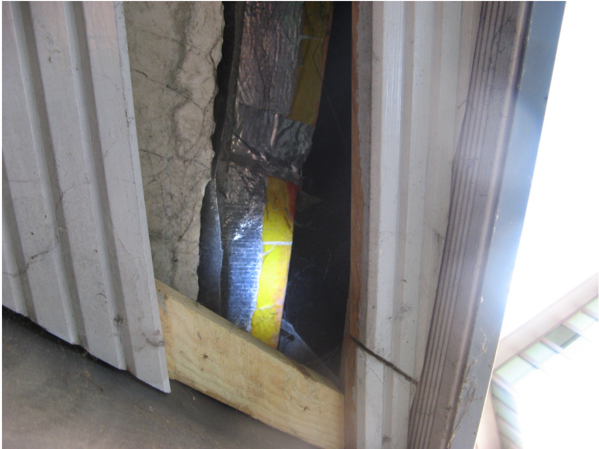
Figure 17 – Inspection Area 2 - removal of existing fluted timber decking board to soffit fixed on softwood battens, revealing existing insulation to concrete slab edge above.