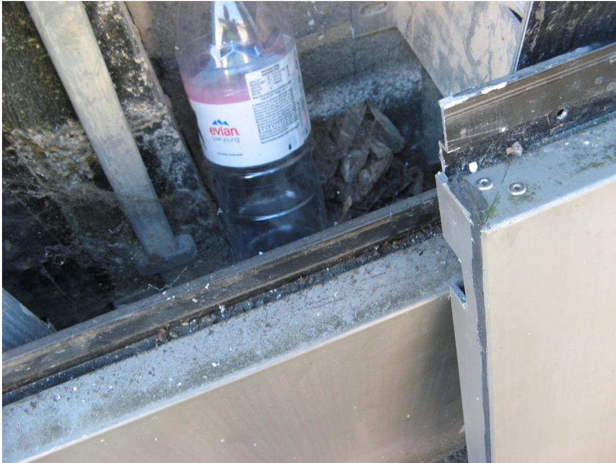
Figure 11 – Inspection Area 1 - existing composite metal rainscreen cladding (ACM) at junction between SG curtain walling and tiled masonry, exposing blockwork substrate behind.