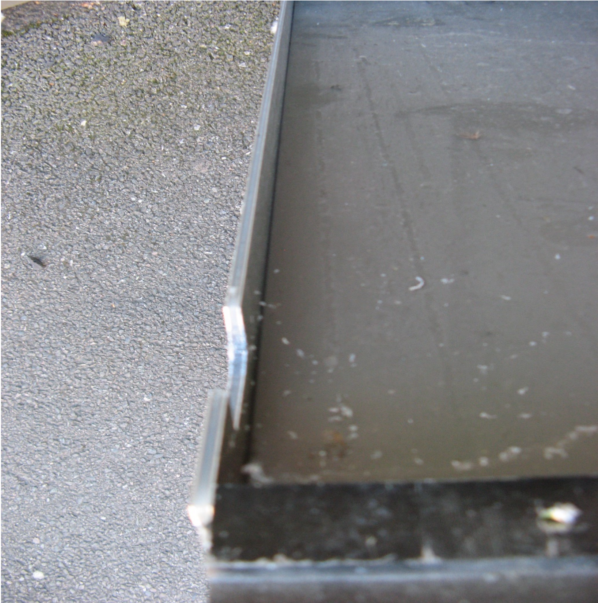
Figure 10 – Inspection Area 1 - existing composite metal rainscreen cladding (ACM).