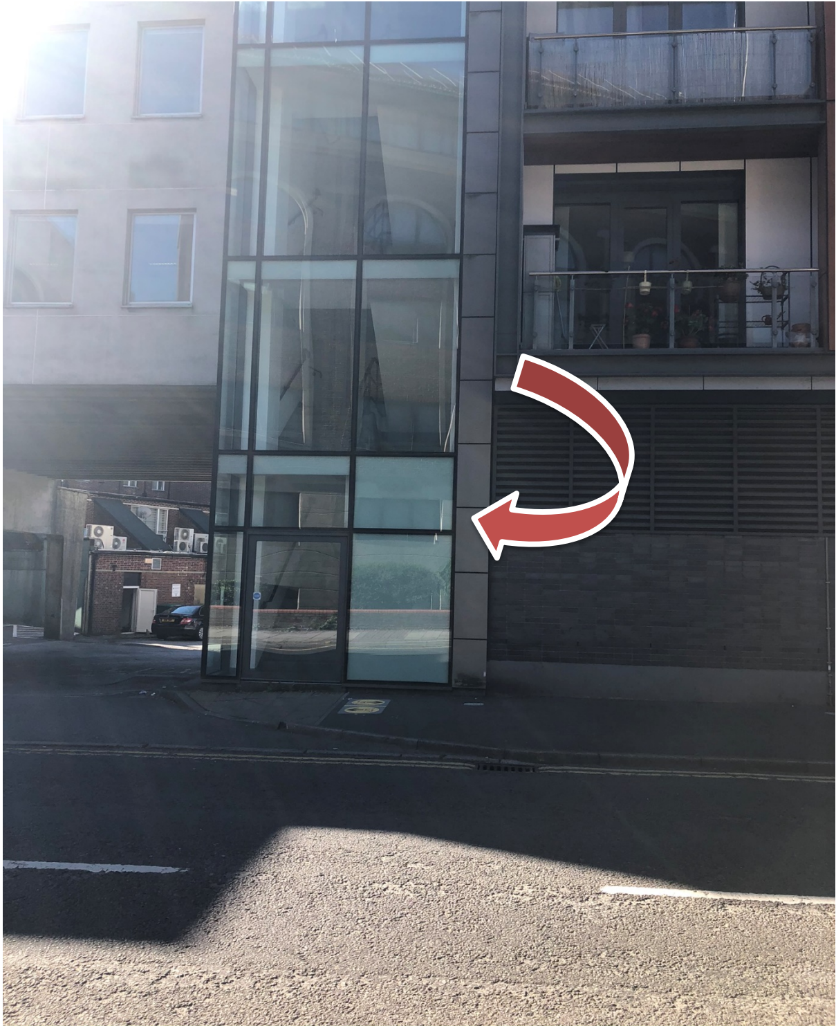
Figure 3 – Main elevation – Inspection Location Area 1