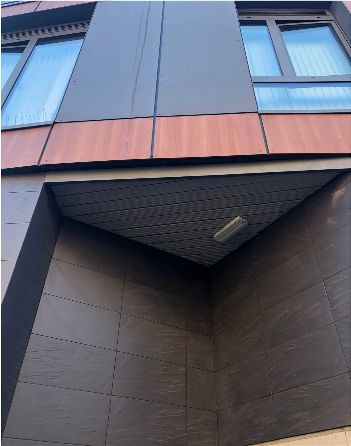
Figure 14 – Inspection Area 2